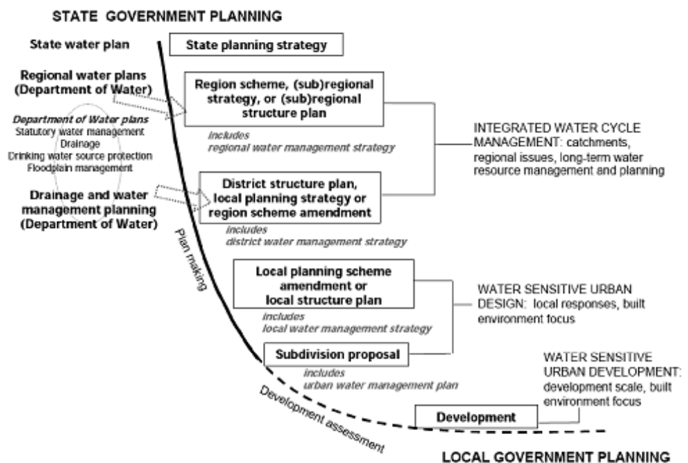
Figure 1 – – Integrating water planning with the land planning process

The framework for WSUD implementation at each stage of the planning process is illustrated in figure 1 below.